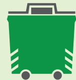
Roadside wheelie bin