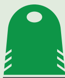
Roadside recycling bank

The collection system differs depending on the residential area. Depending on space and road layout, there are green recycling banks, or green wheelie bins in the historic centre of the town.