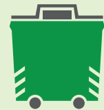
Roadside wheelie bin